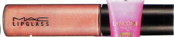
COLOR SHOT Fruit-flavored Lancôme Juicy Tubes Jelly Ultra Shiny Lip Gloss in Miracle "tastes yummy" while the transparent shimmer "stays on better than any other gloss."

Log on to ELLE.com/Top5 to vote for your beauty favorites and view past poll results.