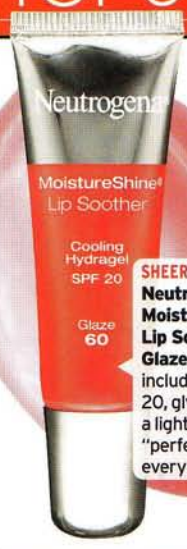
SHEER PLEASURE Neutrogena MoistureShine Lip Soother in Glaze "has it all," including SPF 20, glycerin, and a light tint that's "perfect for every skin tone."

You voted these lip glosses your summertime makeup essential