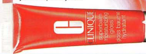
MOISTURE SURGE Clinique Superbalm Moisturizing Gloss in Raspberry is packed with antioxidants, while the "splash of color" makes on-the-go touch-ups "super easy."