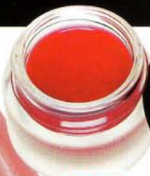
POT PAINT You say NARS Lip Lacquer in Baby Doll "picks a colorful punch." The finger-friendly texture "isn't too sticky," and the bright pigment is "great for day or a night out."