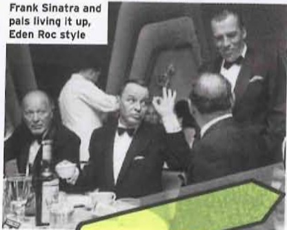
Frank Sinatra and pals living it up, Eden Roc style

ballroom; the Rat Pack partied by the pool; Lucille Ball and Desi Arnaz lived in the penthouse while filming episodes of I Love Lucy on the grounds; and the likes of Elizabeth Taylor, Katharine Hepburn, and Olivia de Havilland have all signed the guest registry. It's safe to say that the inaugural ELLE Spa, which opened at Eden Roc in May, is in legendary company.