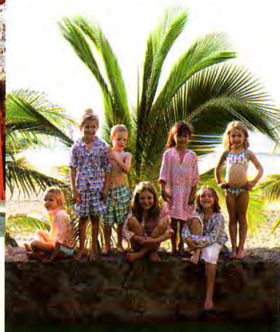
On the Waterfront Clockwise from far left: A fishing boat in Sayulita Bay; tuna tartare at Don Pedro's Restaurant & Bar; making friends on the beach in Sayulita; shopping near the plaza.