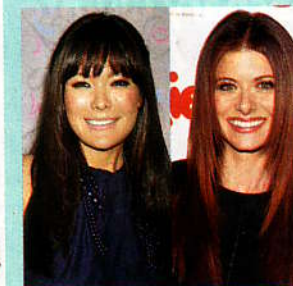
Price (left) rocks bangs; Messing has a center part.